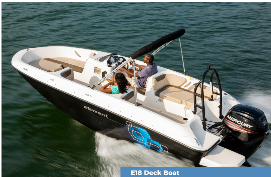
E18 Deck Boat