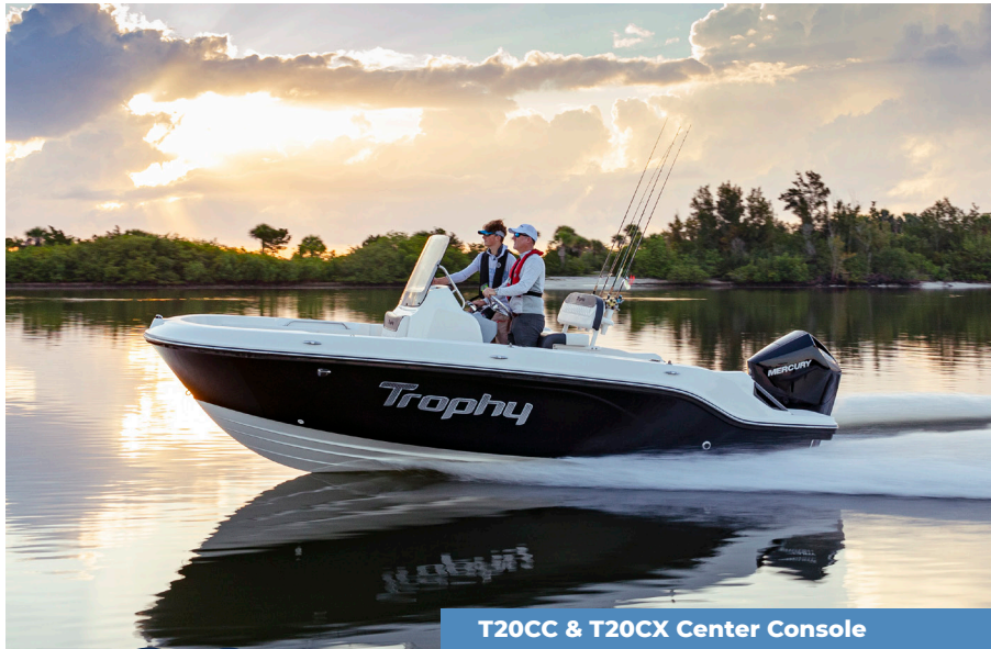
T20CC & T20CX Center Console