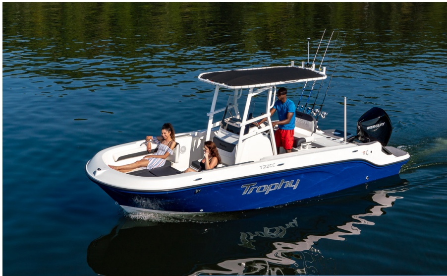
T22CC & T22CX Center Console