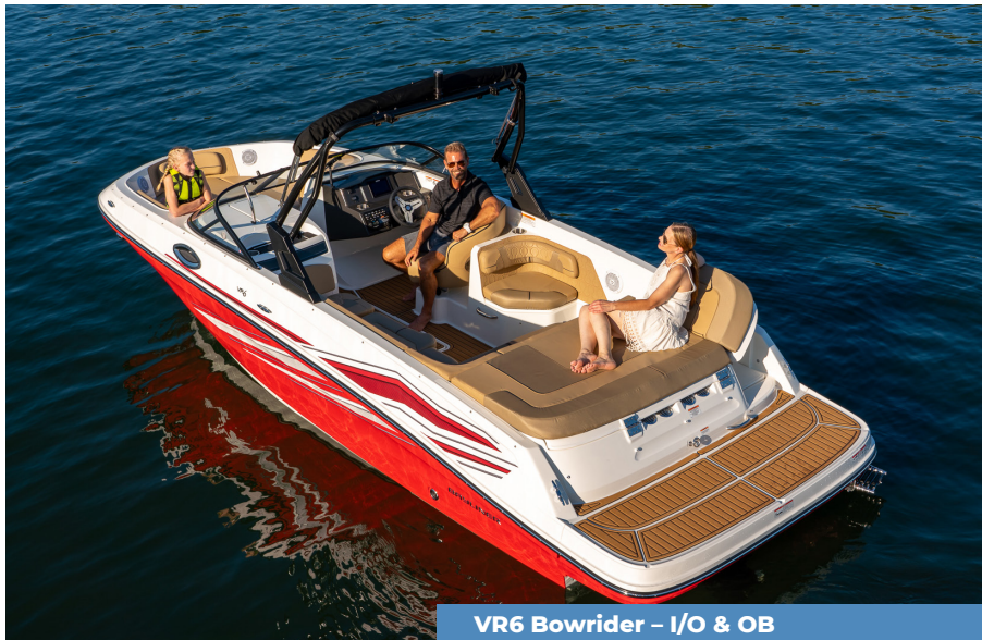
VR6 Bowrider – I/O & OB